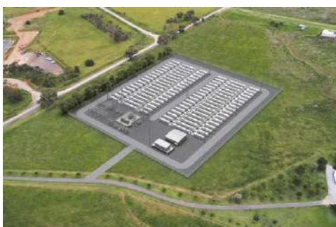
Figure 1.1 Example of a BESS development

Diversify income and increase revenue to ancillary services such as food and accommodation to the local area.